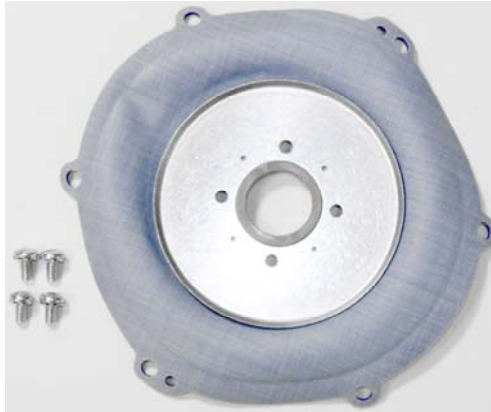
Repair Kit, P/N RKD1-20-3 with fluorosilicone diaphragm, plate and bushing preassembled, plus 4 screws. RKD1-20-3B is identical, but also includes a lower bushing.

The IMPCO PPI-124 repair kit instructions will provide the technician information to successfully repair the 600 Mixer/Carburetor. Always inspect the major casting pieces for damage, corrosion or cracks before attempting a service repair. Be sure the repair kit part number you are using is correct for the carburetor being serviced.